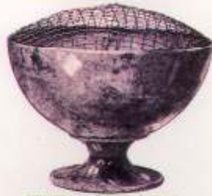
FRUIT or ROSE BOWL (Wgt. Design) No. 130 8 in. dia., 5½ in. high. 10/- Also supplied with lid for Bath Saks, etc. - Complete 13/6