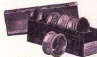
SERVLETTE RINGS No. 197 Six assorted Self or Marbled colours in fancy cardboard box 6/-