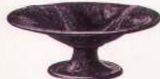
FRUIT or CAKE STAND No. 112 7½ in. dia., 3 in. high 5/6