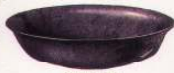
FRUIT DISH No. 182 9½ in. dia., 2½ in. deep 5/6