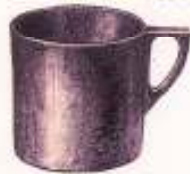
MUG No. 174 ½ pt. 2/6 No. 175 ½ pt. 1/9