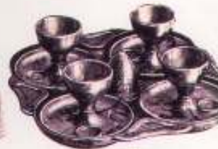
EGG SET (Pat. Design) No. 1805 Four egg cups and salt pot on specially designed tray, recessed so that the cups do not slip off. A most useful and acceptable gift. Boxed complete. Each 12/6