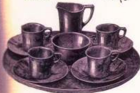
COFFEE SET No. C4 12 in. Tray, No. 181; Four Cups and Saucers, No. 164-179; Cream Jug, No. 137 and Sugar Basin, No. 138. Weight, 1 lb., 10 oz. 17/6