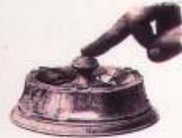
EVERCLEAN ASHTRAY (Patent) No. 125 Press the knob and the cigarette or cigar end disappears and is extinguished. Easily cleaned by unscrewing the base. Each 7/6