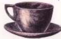
BREAKFAST CUP and SAUCER No. 152/3 2/3