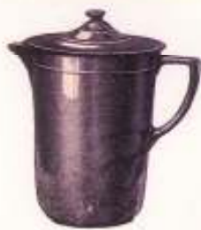
JUG No. 172 1½ pints 5/6 No. 172L Lid 2/-