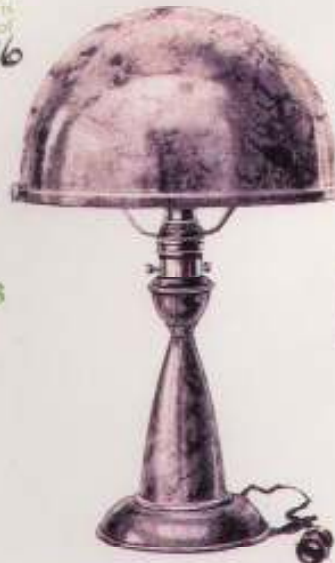
ELECTRIC TABLE LAMP (Pat. Design) No. 152D With tilting Dome Shade for reading or bedside. weighted base, soft restful light. Each 32/6