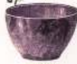
BASIN No. 189 2½ in. dia. 9d. No. 138 3½ in. dia. 1/6 No. 134 4½ in. dia. 2/- No. 140 5½ in. dia. 3/-