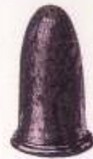
SUGAR SIFTER No. 176 3/6