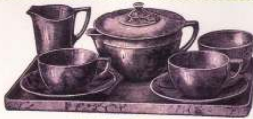
MORNING TEA SET No. T42P, with Tea Pot, No. 145 25/- Weight (with Pot) 1 1/2 lb. 15/6 No. T42, without Tea Pot. Weight, 1 1/2 lb. 15/6 A gift which will have daily use, and being light in weight, is just the thing for invalids. No. 143 Tray only, size 13 in. x 8 in. 7/6