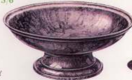
FRUIT DISH No. 113 A dish of useful size and capacity, 12 in. dia. 12/6