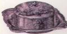
BUTTER DISH (Pat. Design) No. 133 A most popular and useful line. Each 4/3