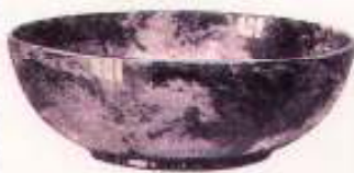
BOWL No. 154 For Salad or Fruit. 8½ in. dia. 7/6