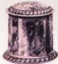
TOBACCO JAR No. 148T. Each 6/9