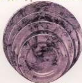
CHEESE PLATE No. 187 5½ in. dia. 1/6 TEA PLATE No. 139 6½ in. dia. 1/3 DESSERT PLATE No. 161 7½ in. dia. 2/9 PUDDING PLATE No. 148 8½ in. dia. 2/9 BREAD and BUTTER PLATE No. 158 8½ in. dia. 3/6