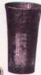
FLOWER TUBE No. 188 5½ in. high 2/3