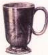
TANKARD No. 163 ½ pt. 3/6