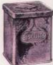
BISCUIT BOX (Wgt. Design) No. 80. Also sup- plied marked "Tea Sugar," holds 2 lbs. sugar. 5½ in. x 4 in. square. Each 5/11