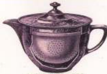
PATENT TEA POT Complete with Metal Infuser No. 145 2 pt. 9/6 No. 144 1½ pt. 10/6 Stand for Tea Pot No. 167 2/-