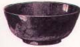
BOWL No. 183 7 in. dia., 3 in. deep 4/6 No. 183L With cover for Vegetable Dish 7/6