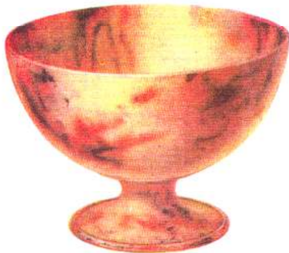
MARBLE (M) No. 130