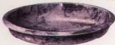
FLOATING BOWL No. 131 10 in. dia. 6/6 No. 106 8 in. dia. 4/6