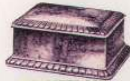
CIGARETTE BOX (Pat. Design) No. 149 Useful gift. For 50 cigarettes, or can be used for sardines. Each 6/-