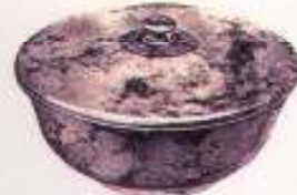
BOWL No. 183L A useful bowl for Powder, Bath Salts, etc. 7in. dia. x 3in. deep. Price with lid. Each 7/6