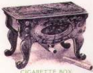
CIGARETTE BOX (Pat. 20,317,771) No. 150 Self-feeding. Cigarettes are drawn from bottom, either side as desired. Nothing to get out of order, a light tap on the box is sufficient to ensure the falling of the cigarettes. Holds 50 cigarettes. Each 10/6