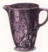
MILK JUG No. 191 Capacity ½ pt. 3/-