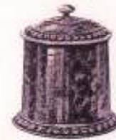
PRESERVE JAR No. 141 ½ lb. Preserve 3/9 No. 148 1 lb. Each 6/9