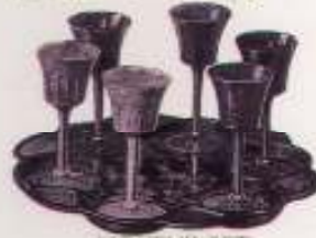
LIQUEUR SET (Wgt. Design) No. 108 Complete 12/6