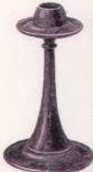
CANDLESTICK (Wgt. Design) No. 147 6 in. high per pair 5/11 Not supplied in self colours