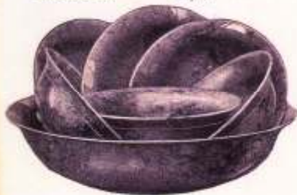
FRUIT SET No. F1 Dish, No. 182, with six No. 157 for Stone Fruit, or No. 185 for Soft Fruit 10/6