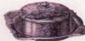
BUTTER DISH No. 133 A most popular and useful line - Each 4/3