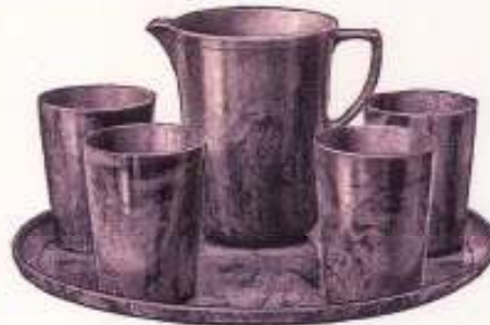
LEMONADE SET No. L4 Tray, No. 181; Jug, No. 172; Four Horns, No. 165B. Weight 16/6 1 lb., 6 oz. No. 181 12 in. Tray only 7/6