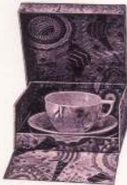
CHILD'S SET No. J1 Tea Cup and Saucer and small Plate, with E.P. Spoon, in fancy coloured cardboard box 3/9